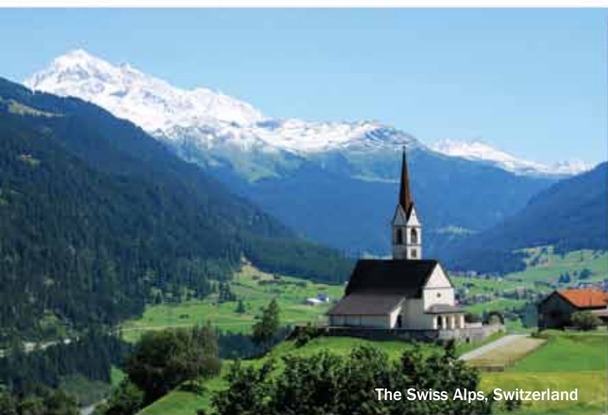
The Swiss Alps, Switzerland

Using a travel agent provides you with peace of mind not found on the internet. Travel agents have been to where you want to go, and can provide firsthand, professional advice to suit all your travel needs and wants. Call us, and we'll get you there!