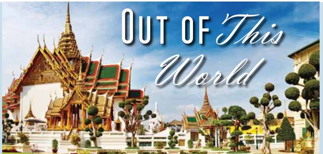
Image: The Grand Palace, Bangkok, Thailand

*Price is per person, based on double occupancy. Additional fuel surcharge may be applied by the airlines without prior notice. International airfare is NOT included. Please ask about our International Airfare Specials from the U.S.A. Supplement and special cancellation policy will apply during Thailand Festival, Christmas and New Year period. Compulsory Dinner will apply for Dec 24, 25 & 31. Rates to be advised. Visa required for Laos, Cambodia & Vietnam. Visa fee is not included